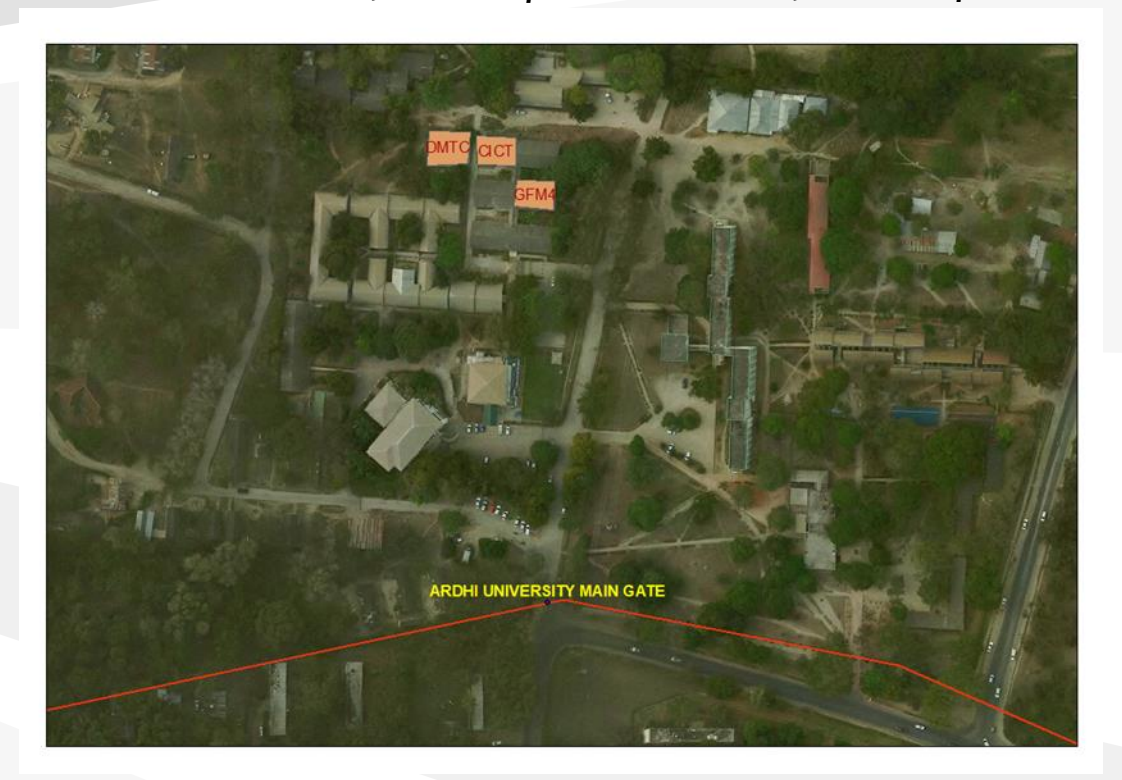
Figure 2: DMTC Lecture Theatre, CICT Computer Lab and GFM4, the venues for the courses