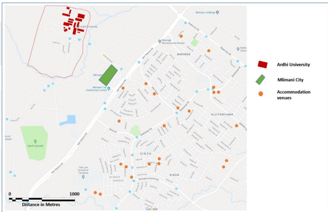
Figure 2: Ardhi University and surrounding areas

The Disaster Management Training Centre (DMTC) at Ardhi University was first established in May 2002, as one outcome of the country's "Strengthening Tanzania Disaster Response Project" (STDRP). STDRP was an initiative of the Disaster Management Department (DMD) of the Prime Minister's Office in response to major disaster incidents in Tanzania in the late 1990s, and was financially supported by USAID. The DMTC has been involved in a number of initiatives and projects to advance disaster risk reduction (DRR) within the country. This includes hosting Postgraduate disaster risk related academic programmes and short course training, consulting for disaster risk assessments, emergency planning and environmental management as well as partnering with the government DMD on numerous disaster risk related research projects across the country.