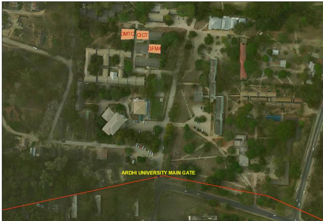
Figure 2: DMTC Lecture Theatre, CICT Computer Lab and GFM4, the venues for the courses